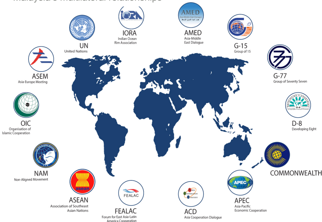
Source: Foreign Policy Framework of the New Malaysia: Change in Continuity, June 2019